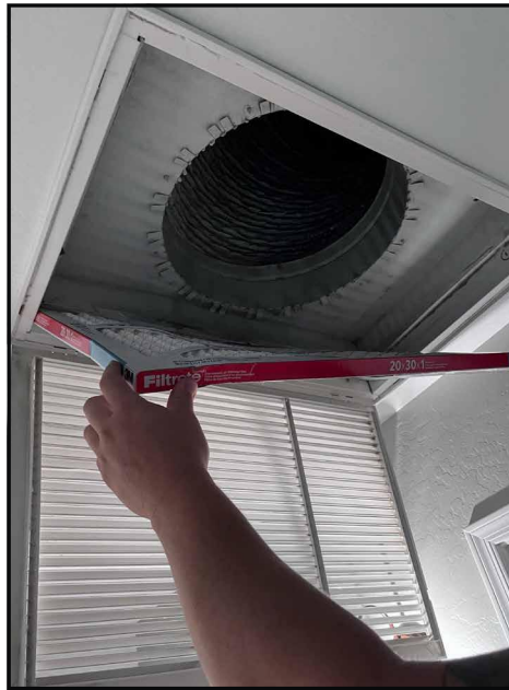
THIS SUCKS. Filters can get sucked into the return and past the flanges.