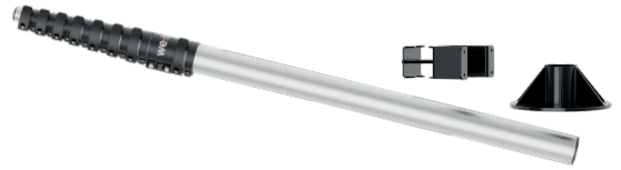
Telescoping Mounting Pole (900071 extends to 24 feet), Wall Mount Brackets, Top Stabilizer & Pole Foot