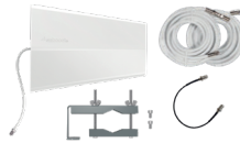
Outside Antenna (314445), Mounting Bracket, (2) 15 ft. Cables & Window Entry Cable