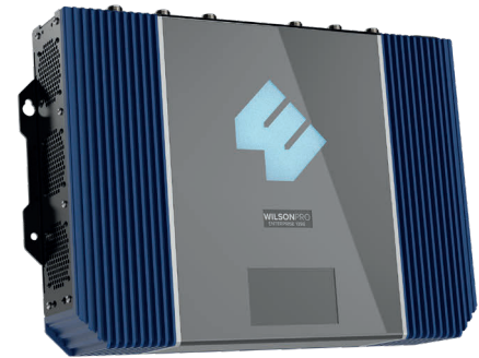
WALL MOUNT OPTION (Amp Only 460072)