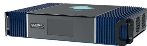
RACK MOUNT OPTION (Amp Only 461072)