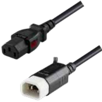
Black Cable Render