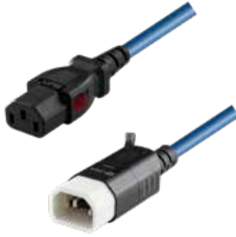
Blue Cable Render