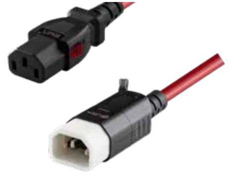
Red Cable Render