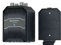
IoT 3.0 2x2 Amplifiers (460079) & Wall Mount Bracket