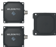
(2) Power Over Coax Units (ACC000084) & Bracket