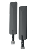
(2) External Hinged Antennas (ANT000058)