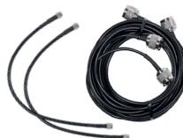
20' Conjoined N to N Cable & (2) 1' SMA to SMA Cables (CBL000144, CBL000141)