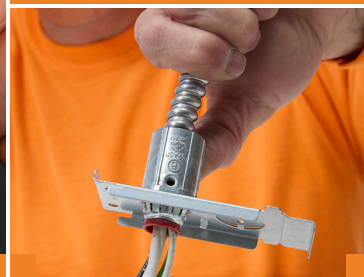
MC POWER AND CONTROL SYSTEMS