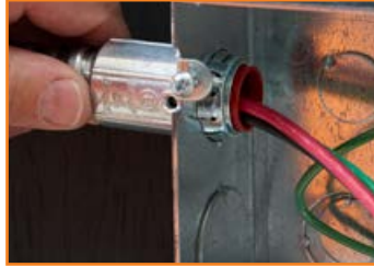
Flexible Metal Conduit