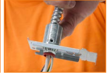
MC Power and Control Systems