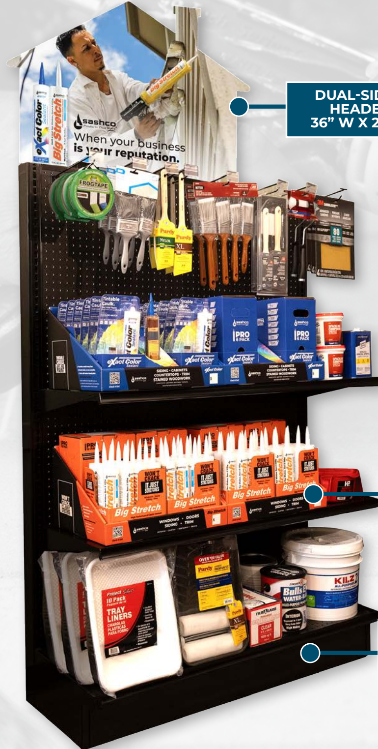
DUAL-SIDED HEADER 36" W X 25" H