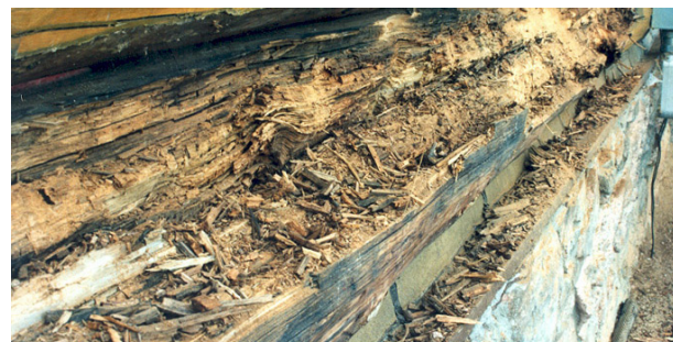
Tim-bor® helps prevent rot before it starts.