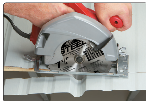
Metal Building Panels

Specially formulated, tough c-6 carbide tipped blade fits all popular brands of portable circular saws. Lasts up to 30 times longer than abrasive disks for cutting unhardened ferrous metal. Makes true, flat cuts in standing seam metal roofing and metal building panels without burning paint or protective coatings. Also makes clean cuts in metal studs, light angle iron, and thin walled pipe.