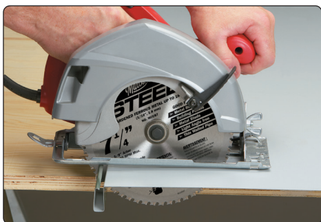
Standing Seam Metal Roofing

Cool Clean Cuts in metal roofing & metal building panels