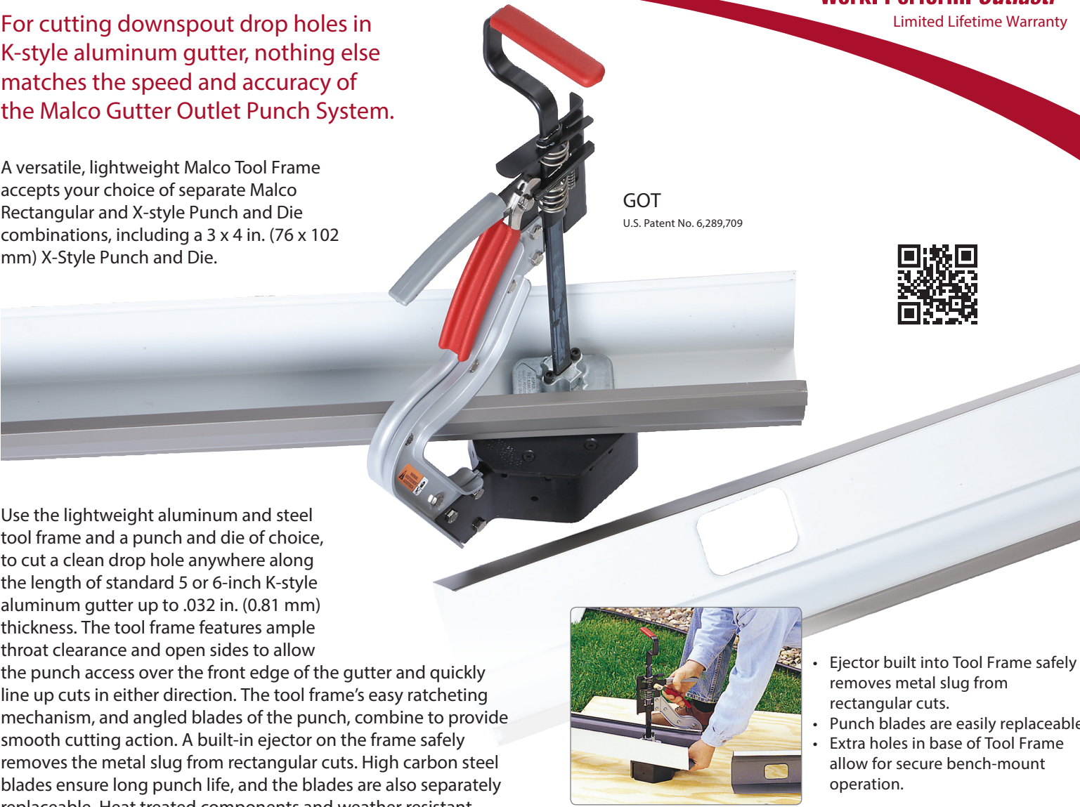
GOT U.S. Patent No. 6,289,709

A versatile, lightweight Malco Tool Frame accepts your choice of separate Malco Rectangular and X-style Punch and Die combinations, including a 3 x 4 in. (76 x 102 mm) X-Style Punch and Die.