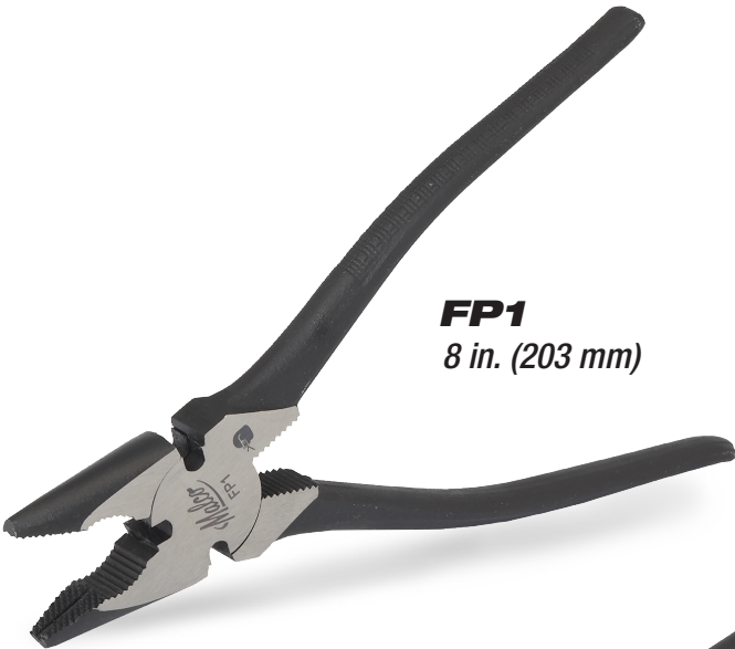
FP1 8 in. (203 mm)

This legendary fencing pliers design features three serrated jaw areas for gripping, pulling, and tying fence wire. Also, three built-in wire cutter locations ensure easy access for cutting up to 9-gauge (3.8 mm) chain link fence or tensioning wire. A compact, rounded, and tapered nose allows easy entry and reach into tight areas. Textured handle surfaces promote safe and sure control. Durable hardened all-steel construction offers long, dependable service life.