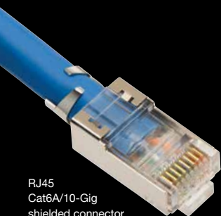
RJ45 Cat6A/10-Gig shielded connector P/N 106190