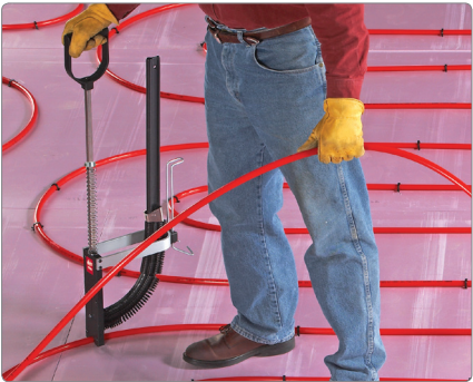
Slide weight and wire-form stand!