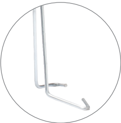
Retractable wire-form stand