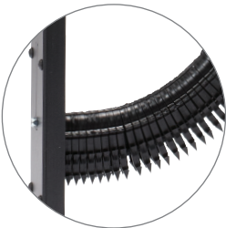
Non-jamming extraction of staples