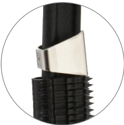
Slide weight for easy feeding

Operates from a standing position! Lightweight one-piece polymer magazine stands up to any job-site environment. A leaf spring controlled stop automatically adjusts to guide staples through the fastening mechanism without risk of jamming or deforming. Magazine loading-strips of 25 staples are joined together with a discreet plastic weld that allows staples to separate cleanly as they are engaged by the fastening mechanism. A magazine slide weight ensures smooth feed and uninterrupted stapling when laying out PEX. Sturdy, retractable wire-form stand allows stapler to stand upright when not in use or when reloading staples. Compatibility: Malco Foam Board Stapler and Staples (FBSN, FBSN1 & FBSN2) are compatible with most popular brands of foam board stapling systems. Malco 1-1/2 in. (38.1 mm) staples are designed for 1 in. (25.4 mm) foamboard. Additional Barbs on 2 1/2 in. (63.5 mm) Staple "Double the Holding Strength" in 2 (50.8 mm) foamboard.