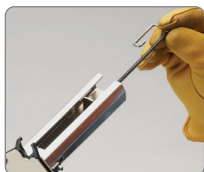
Easy to Load and Lock!