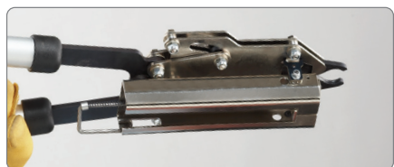
Collapsible Magazine for Easy Storage!