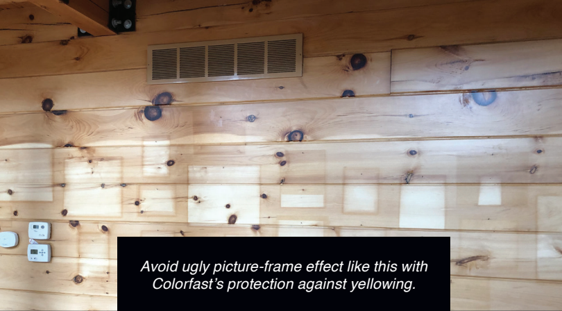
Avoid ugly picture-frame effect like this with Colorfast's protection against yellowing.