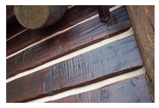
Freshly restained Sikkens® for reference, "new" vs. approximately 5 years later in the other photos throughout this paper.