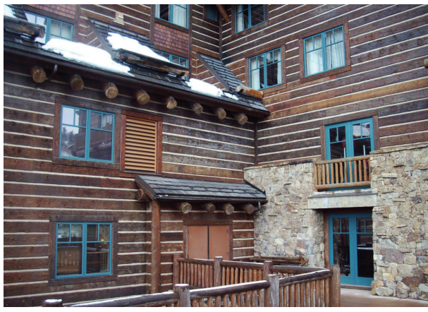
Photo above and below: What Sikkens looked like after 5 years. Not horrible, but definitely deteriorating.