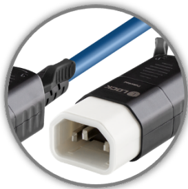
Available in multiple connector configurations, colors & lengths