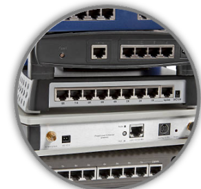
Universally compatible with electronics & power equipment