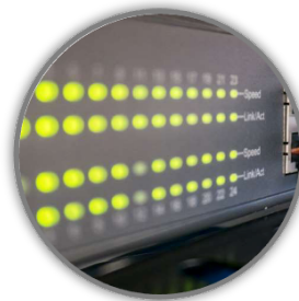
Ensure equipment uptime by securely locking into equipment ports