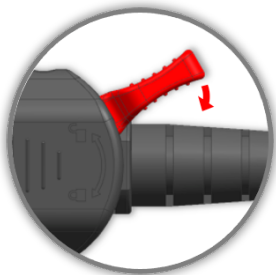
Patented latch system easily locks & unlocks with a finger press