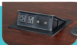
PSRF-USB-2 Pop up Power Receptacle