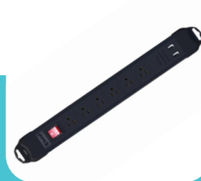
Power Receptacle PSSM-6-2