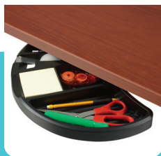
Swivel Pencil Tray 300PTB