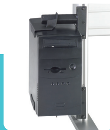
310CPU Adjustable CPU Holder