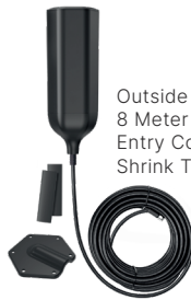
Outside Antenna, 8 Meter Cable, Cable Entry Cover & Heat Shrink Tubes