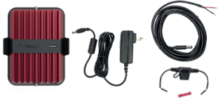
Drive Reach Signal Booster, Bracket, Power Supply & Hardwire Power Supply with In-line Fuse Holder