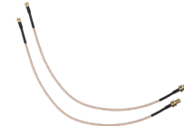
1 ft. SMA to MMCX Cable & 1 ft. SMA to MCX Cable (953012, 953013)