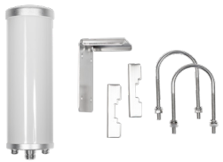
Omni Plus Antenna with Bracket & Hardware (314422)