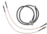
2 ft. SMA to N Male Cable, 1 ft. SMA to MMCX Cable & 1 ft. SMA to MCX Cable (295802, 953012, 953013)