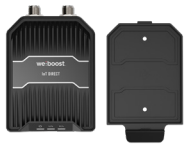
IoT Direct Amplifier & Wall Mount Bracket (460079)