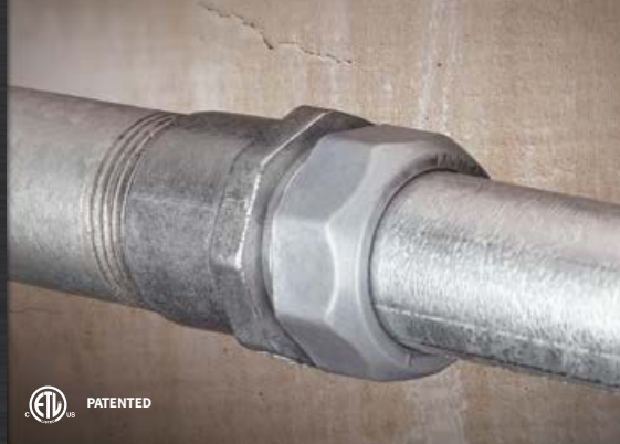
290-RT TO 299-RT THREADED RIGID TO RAIN-TIGHT EMT 1/2" TO 4" TRADE SIZES