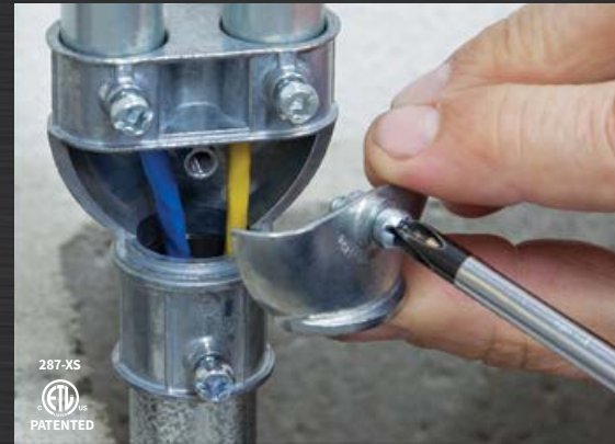
MERGE TWO EMT TO ONE 4256-DC (2) 1/2" TO (1) 3/4" 4258-DC (2) 3/4" TO (1) 1"