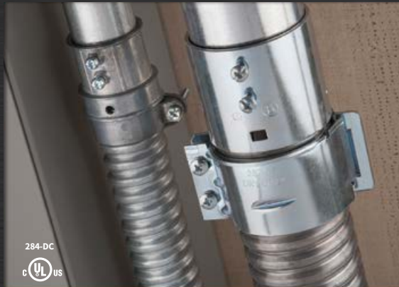
287-XS TO 290-XS TRANSITION COUPLINGS 2-1/2" TO 4" EMT/RIGID TO FLEX