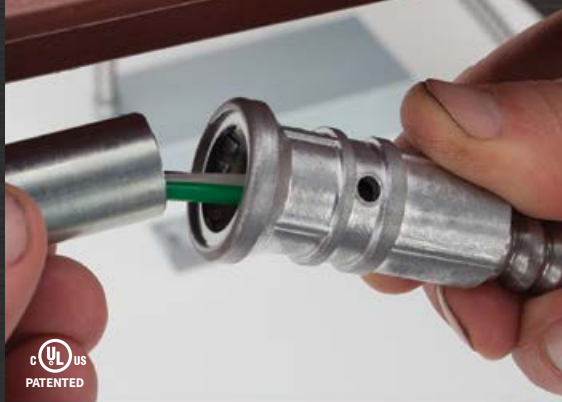
2280SPMB AND 281SPMB 1/2" OR 3/4" EMT TO MC CABLE