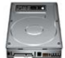
The drive will be called NEXTBASE