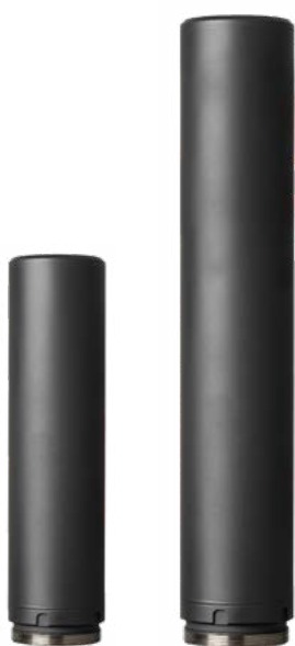
Specwar 556 Specwar 762