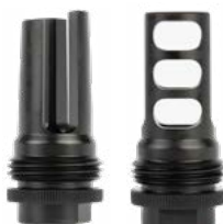
ASR Muzzle Device 556: Flash Hider 1/2x28, .223 CAL 762: Muzzle Brake 5/8X24, .30 CAL