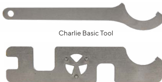
Charlie Basic Tool