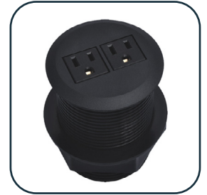
3" Grommet Power Dock 2 Grounded AC Outlets (125V 15A) 54815