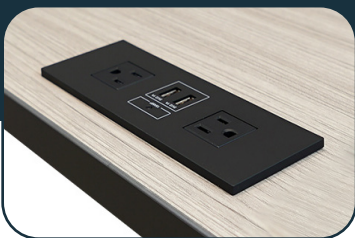
Flush Mount Charging Dock 2 USB Ports (2.1A Each) & 2 AC Receptacles 54211