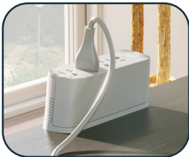
MODPOWER (SURFACE MOUNT) Primary Unit 54784MG Middle Unit 54785MG End Unit 54786MG