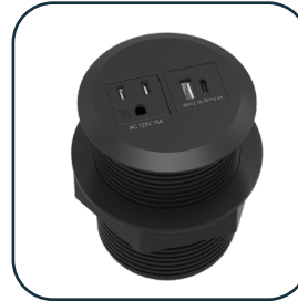
3" Grommet Power & USB Charging Dock 1 USB-A (2.1A) & 1 USB-C (2.4A) Ports 1 Grounded AC Outlet (125V 15A) 54816