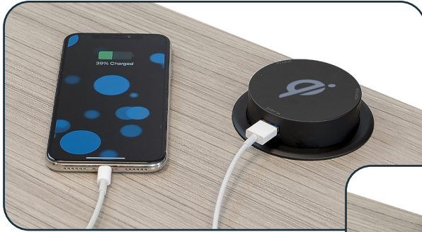
Wireless & USB Pop-Up Charging Dock 1 USB-C (2.4A) & 2 USB-A Ports (1A Each) 54209