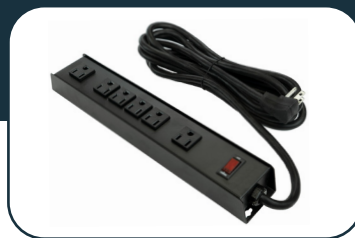
Surface Mount Power Receptacle 6 AC Receptacles PSSM-6-2

Don't see what you're looking for? WE HAVE ALTERNATE POWER OPTIONS AVAILABLE Call us for a quote | 800.298.4351