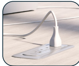
MODPOWER (FLUSH MOUNT) Primary Unit 54787MG Middle Unit 54788MG End Unit 54789MG