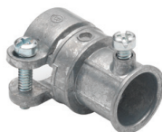
281-DC, 282-DC, 282-DCX, 283-DC