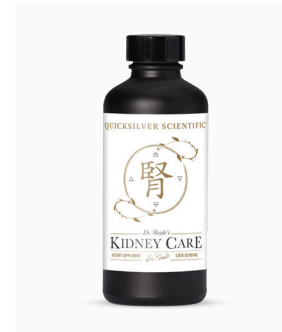
Dr. Shade's Kidney Care QTY 2 - 100 mL Bottles