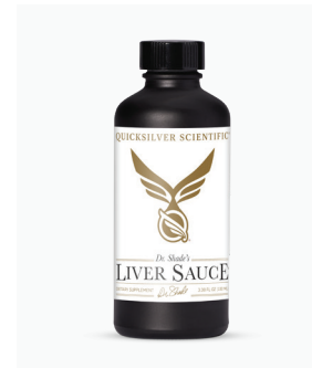
Dr. Shade's Liver Sauce® QTY 2 - 100 mL Bottles