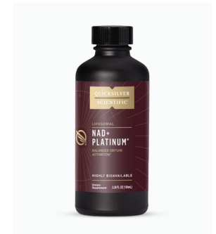
NAD+ Platinum® QTY 2 - 100 mL Bottles