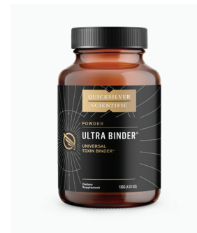
Ultra Binder® Powder QTY 2 - 30- 1 tsp servings