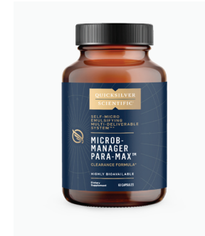
Microb-Manager Para-Max™ QTY 1 - 60 capsules