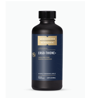
Ergo-Thione+ QTY 2 - 100 mL Bottles