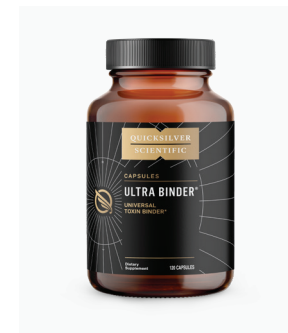
Ultra Binder® Capsules QTY 1 - 120 capsules