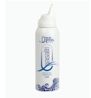
Quinton® Action Plus Nasal Spray QTY 1 - 100 mL Bottle