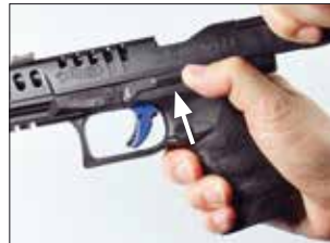
4.5 Fig. 3