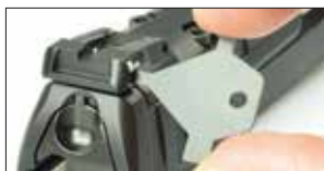
6.3.3 Fig. 2

If shots group to the left, turn the rear sight windage screw clockwise, if they group to the right, turn the windage screw counter clockwise. Use the smallest blade of the screw driver provided to do so (6.3.3 Fig. 2).