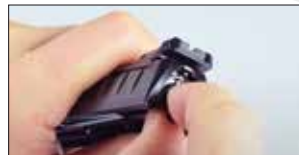
5.2.2 Fig. 2

Note: The striker interferes with the striker safety. If you want to remove the striker safety, first remove the striker assembly as described in section 5.2, and then continue with the extractor and the striker safety.