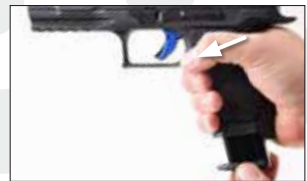
5.1.1 Fig. 1