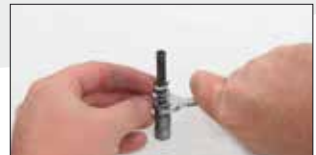
5.5.1 Fig. 1