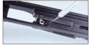
5.3.1 Fig. 1