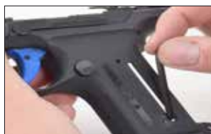
6.2 Fig. 3