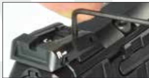
6.3.3 Fig. 4

Field-strip the pistol as described in section 5.1.1. Loosen both set screws using the smaller of the two hexagonal wrenches provided (size 1.5 mm, 6.3.3 Fig. 4) and slide the rear sight sideways and off the mount base (6.3.3 Fig. 5).