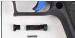
6.1 Figure 4