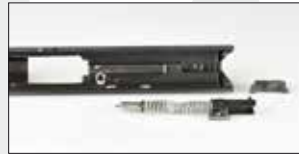
5.2.1 Fig. 3