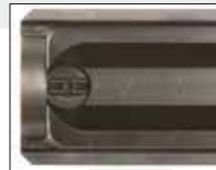
6.3.1 Fig. 1

Unscrew the front sight screw with a 1.3 mm Allen wrench from the bottom of the front sight. Push the front sight out of the slide. Assembly is in reverse order. Screw in the front sight screw until it is flush with the base of the front sight (6.3.1 Fig. 1).