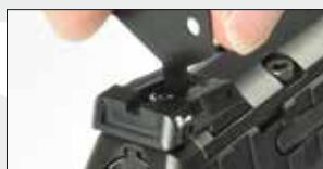
6.3.3 Fig. 3

If shots group high, turn the rear sight elevation clockwise, if they group low, turn the elevation screw counter clockwise. Use the largest blade of the screw driver provided to do so (6.3.3 Fig. 3).