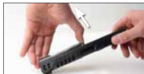
5.1.1 Fig. 6