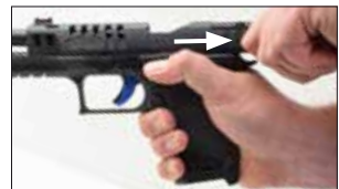
5.1.1 Fig. 2