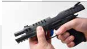
5.1.1 Fig. 5