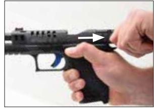
4.1 Fig. 2