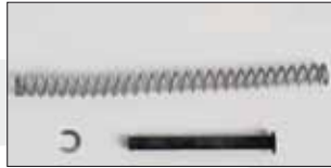
5.5.1 Fig. 3