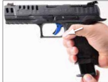
3.2.2 Fig. 1

Grasp the pistol with your finger off the trigger and outside the trigger guard. Depress the magazine release and remove the magazine (3.2.2 Fig. 1).