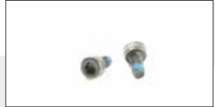
6.3.4 Fig. 2

Note: Do not mix the two hex socket screws with screws that come with other sights. The hex screws to secure the mount bases are metric hex screws, size M3x6. Two spare hex screws (6.3.4 Fig. 2) are included in the pistol case. The pre-applied blue thread locker is to secure the hex screws in place while shooting your pistol.