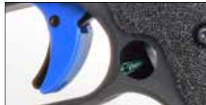
6.1 Fig. 5