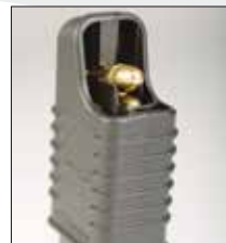
4.2.1 Fig. 3

Put the magazine loader with its long wall oriented to the rear on top of the magazine (4.2.1 Fig. 3). Press down the magazine loader and insert a cartridge with your other hand (4.2.1 Fig. 4). Let the magazine loader go up again. Push in the cartridge completely with your hand (4.2.1 Fig. 5). Repeat the procedure for the number of cartridges you wish to load, up to the magazine capacity.