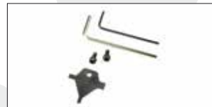
6.3.3 Fig. 1

The dovetail cut for the rear sight is a 12mm x 2mm x 70° LPA cut. The height of the front sight is 0.21" (5.3 mm).