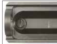
6.3.2 Fig. 1

Remove the front sight screw using a screwdriver and press the front sight upwards and out. Assembly is in reverse order (6.3.2 Fig. 1). Remember to make sure the screw and the thread inside the front sight are free of oil or grease. The thread of the front sight screw should be secured using an industrial adhesive (for example Loctite 648). To tighten the front sight screw, apply a torque of 8.8 inch lbs (1 Nm).