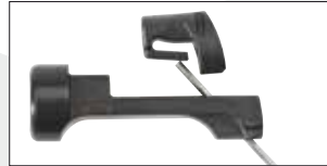
6.1 Figure 2