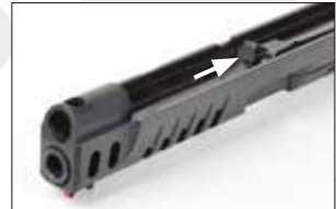
5.1.2 Fig. 1