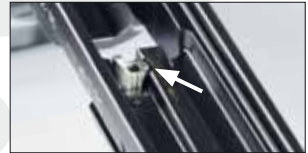
5.3.2 Fig. 1