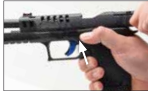
5.1.1 Fig. 3