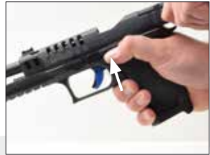
4.1 Fig. 3