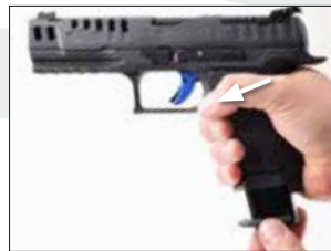
4.5 Fig. 1