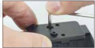
6.3.4 Fig. 3

Place the new mount base on top of the slide with the markings facing down. Keep pulling the mount base toward its front stop (toward muzzle end of the slide) while tightening the hex socket screws (6.3.4 Fig. 3). Tighten both hex screws (apply a torque of approximately 18 inch pounds (2 Nm)). Now install your after market sight following the instructions provided with it (6.3.4 Fig. 4).