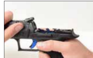
5.1.2 Fig. 3