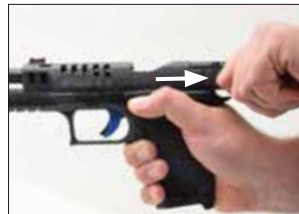
4.5 Fig. 2