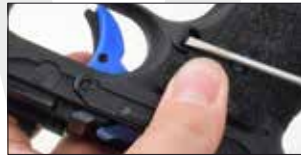
6.1 Figure 3