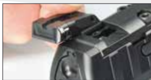
6.3.3 Fig. 5

In case of any after market rear sight to be installed, please follow the specific instructions provided with this rear sight.