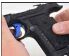
6.2 Fig. 2