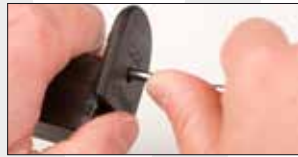
5.4.1 Fig. 1