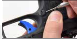
6.1 Figure 1