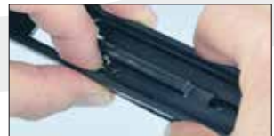
5.3.2 Fig. 3