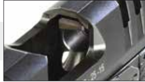
5.1.1 Fig. 4