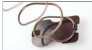
5.4.2 Fig. 2