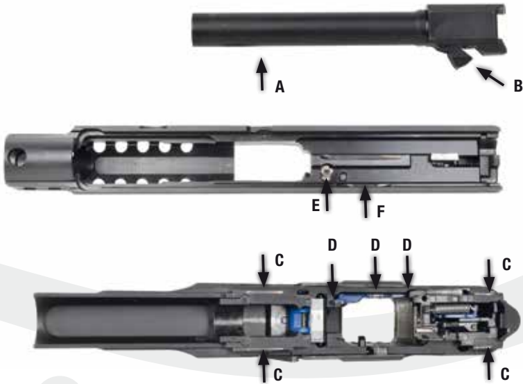
5.7 Fig. 1