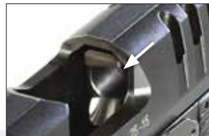
4.5 Fig. 4