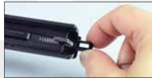
5.2.2 Fig. 1