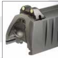
6.3.2 Fig. 2

Windage adjustments are made by drifting the iron rear sight from side to side with the rear sight adjustment tool. To adjust, move the rear sight in the direction you wish the group to move on the target. For example: if the group should move to the right, move the rear sight to the right.