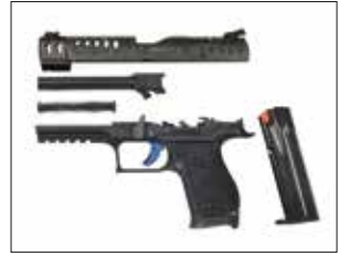
5.1.1 Fig. 7