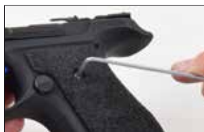
6.2 Fig. 1

Before replacing the grip panel, make sure that the four magazine guides are in the frame again (6.2. Fig. 1). Push the grip panel onto the frame from behind. Tighten the screws with 0.6 Nm.