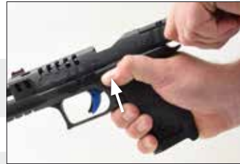
3.2.3 Fig. 1

Grasping the grip of the frame and with your finger off the trigger and outside the trigger guard, depress the magazine release, and completely remove the magazine. Firmly grasp the serrated sides of the slide from the rear with the thumb and fingers. While steadily holding the grip, briskly pull the slide fully rearward to extract any cartridge from the chamber and clear it from the pistol.