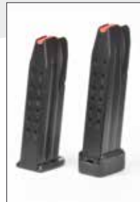
3.2.4 Fig. 1

When the magazine is removed from the magazine well in the grip, the number of rounds can be seen in the witness holes (3.2.4 Fig. 1).