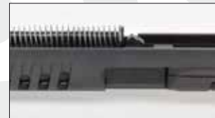
5.1.2 Fig. 2