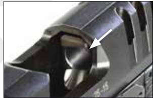
4.1 Fig. 4

⚠ WARNING NEVER RELY ON MECHANICAL FEATURES ALONE. PROPER HANDLING OF THE FIREARM WILL ENSURE THE SAFETY OF YOU AND OTHERS. FIREARM SAFETY IS ALWAYS YOUR RESPONSIBILITY.