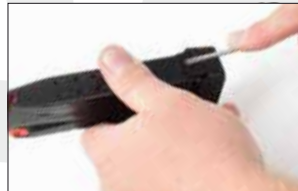
5.4.1 Fig. 2