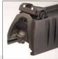
6.3.1 Fig. 2

If shots group to the right, turn the rear sight windage screw clockwise, if they group to the left, turn the windage screw counter clockwise. Adjustment by one click moves the impact point approximately .7" (2 cm) at a distance of 25 yards (25 m) (6.3.1 Fig. 2).