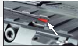
3.2.1 Fig. 1

The loaded chamber indicator is on the right side of the slide. The loaded chamber indicator can be observed when the rear of the extractor is recessed, revealing a red colored marking (3.2.1 Fig. 1).