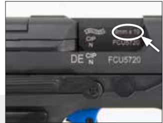
2 Fig. 1

Locate the cartridge designation marked on the handgun. This information indicates the ammunition that must be used in this firearm (see 2 Fig. 1). You are responsible for selecting ammunition that meets industry standards and is appropriate in type and caliber for this firearm.