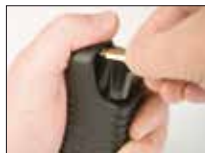
4.2.1 Fig. 4