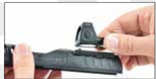
6.3.4 Fig. 4

Docter, Trijicon, and Leupold or DeltaPoint micro red dots can be installed. Mount bases are required to do so. They are available as an optional item and are marked 01 (Docter), 02 (Trijicon) and 04 (Leupold/DeltaPoint).