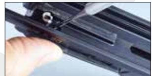
5.3.2 Fig. 2