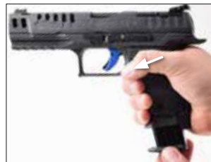
4.1 Fig. 1