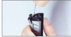
5.2.1 Fig. 1