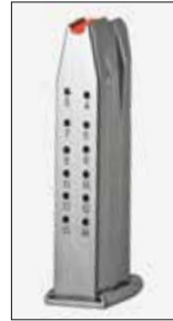
4.2.1 Fig. 1

When the magazine is removed from the magazine well in the grip, the number of rounds can be seen in the witness holes (4.2.1 Fig. 1).