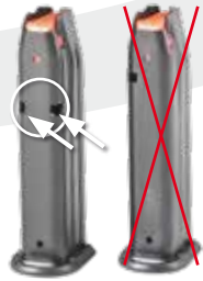
4.2 Fig. 1