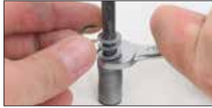
5.2.1 Fig. 2