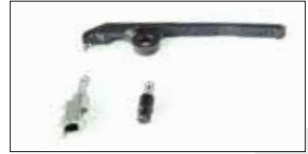
5.3.1 Fig. 2