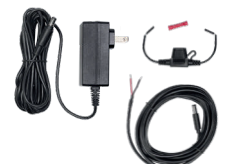
12V AC/DC Power & 12V DC Hardwire Cable (PWR000048, CBL000113)