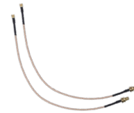
1' SMA to MMCX Cable & 1' SMA to MCX Cable (299154, 291153)