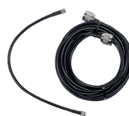
20' N to N Cable & 1' SMA to SMA Cable (CBL000140, CBL000141)