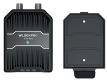
IoT 3.0 Amplifier & Wall Mount Bracket (460079)