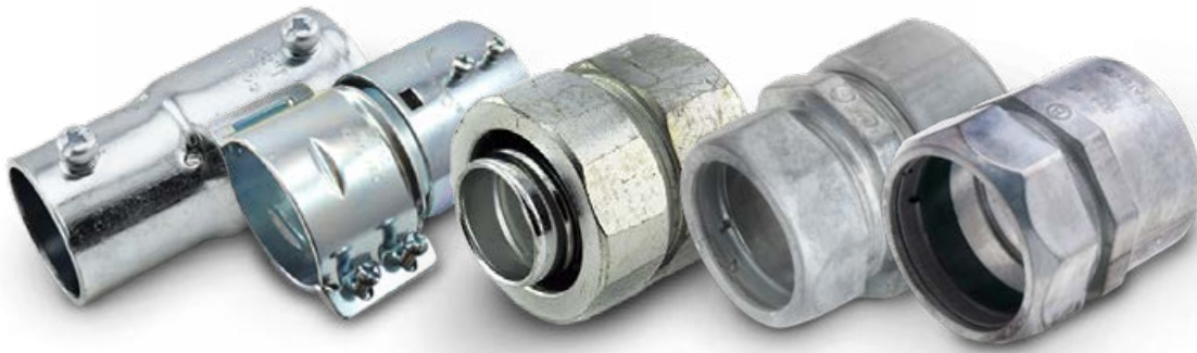
Rigid to Raintight EMT

Pull wire from one raceway to another with our extensive line of listed transition fittings with increased productivity. Save material and implement better approaches in lieu of a box.