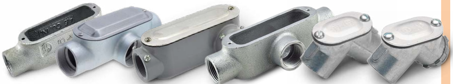
Type LB - Malleable & Aluminum

Provide easy access for maintenance, pulling of wires, and making splices in the conduit system. Made of malleable iron and aluminum in various styles and configurations.