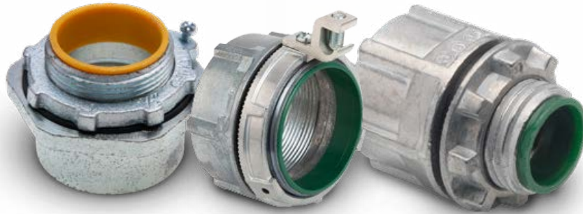
Threaded Hub - Malleable Iron

Our line of malleable iron and zinc grounding, vibration resistant and NEMA 4-rated hubs will withstand many adverse conditions.