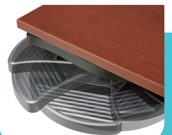
Swivel Pencil Drawer 300PTB