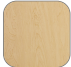
Hardrock Maple (HM) ◆

Featuring eleven laminate colors with coordinating edge band options. High-pressure laminate and custom colors available.