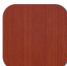
Cherry (CH) ◆