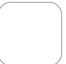
Galaxy White (GW)◆