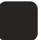
Black (BK) ◆