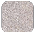
Gray Matrix (GM)◆◆◆