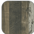
Reclamation Maple (LM)** ◆