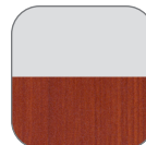
Silver Base (S) Cherry Top (CH)