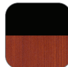
Black Base (B) Cherry Top (CH)

(Only Available on Standard 24" and 30" Configurations)