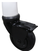
Optional Omega Casters