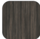
Merapi (ME)** ◆