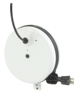
Optional 20' Retractable Power Cord 52294