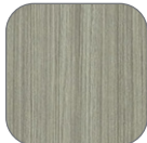
Concrete Groovz (CG)** ◆