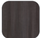
Driftwood (DW)** ◆