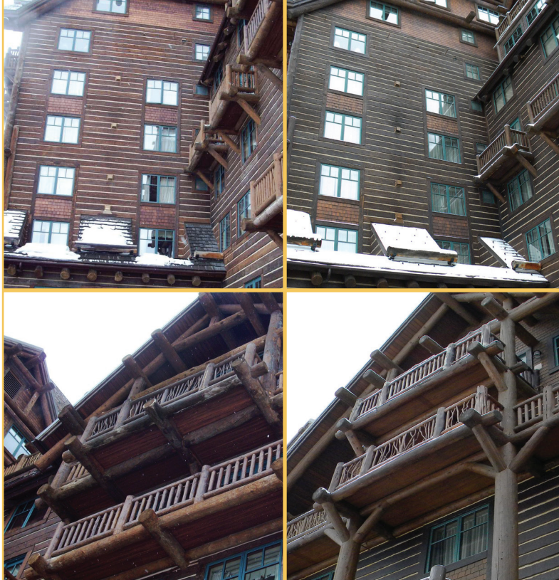
Left side: Sikkens® after 5 years.

Same locations, same sides of the building.