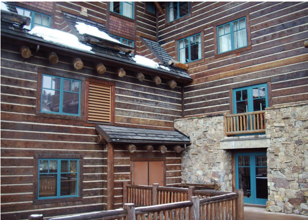
Photo above and below: What Sikkens looked like after 5 years. Not horrible, but definitely deteriorating.