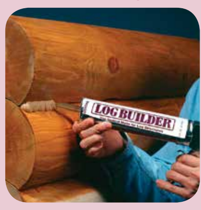
1 – Gun Log Builder into clean, stained joints.*