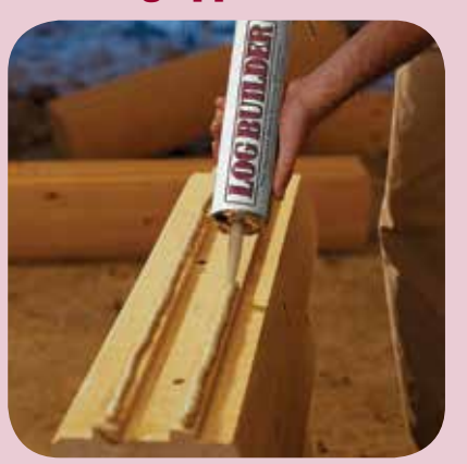
Apply bead(s) according to the log home manufacturer's instructions. Stack the next log and repeat. Don't allow caulk to skin over prior to stacking.