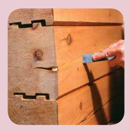
3 – Tool Log Builder.