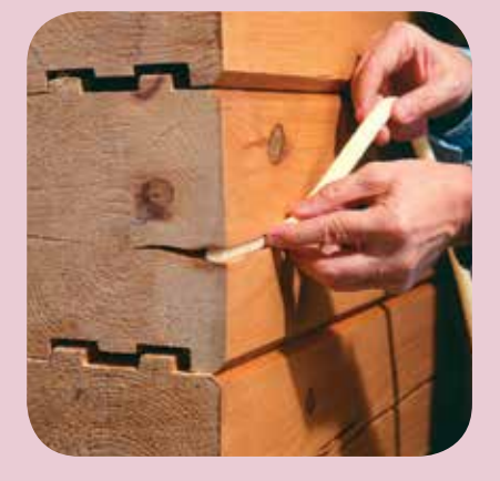
1 – Install backer rod into a clean, stained check to the appropriate depth. (See Fundamental Application Guidelines.)