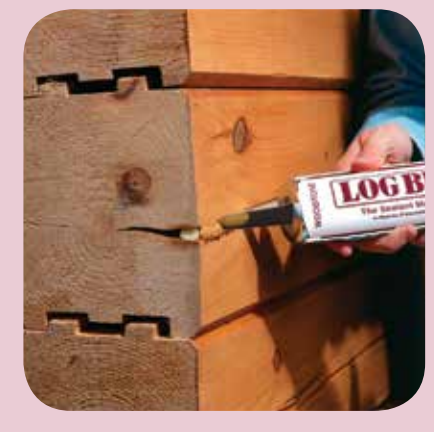
2 – Gun Log Builder over the backer rod.