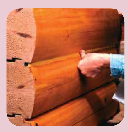
3 – Tool to ensure a tight seal to the top and bottom of the caulk line.