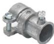
281-DC, 282-DC, 282-DCX, 283-DC